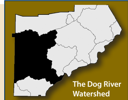
The Dog River Watershed

report, sometimes called a Consumer Confidence Report (CCR) or a Water Quality Report, gives us the opportunity to provide you with a detailed accounting of all the monitoring data gathered from water quality testing during 2014 which went into producing your award-winning drinking water.