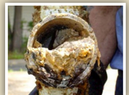
Grease clogged pipe

system. Please scrape grease and food into the trash. Wipe dishes first with a paper towel to remove excess grease before rinsing dishes. Please, never pour fats, oil, or grease down the sink.