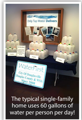
The typical single-family home uses 60 gallons of water per person per day!

WSA and the Atlanta Regional Commission (ARC) completed a source water assessment to identify potential sources of surface water pollution to the Dog River Reservoir and to the Bear Creek Reservoir, a supplemental water supply source. Land use in these watersheds is primarily open/forest or agricultural crop land. In the Dog River watershed, which is 5.6% impervious surface, 57 potential individual sources of pollution were identified, while in the Bear Creek watershed, which has 9.7% impervious surface, 8 were identified. Most information about the overall results and MEDIUM ranking of this assessment can be found on ARC's website at http://www.atlantar-regional.com/environment/water or you can request information by mail from: the Atlanta Regional Commission, Environmental Planning Division, 40 Courtland Street, NE., Atlanta, Georgia, 30303.